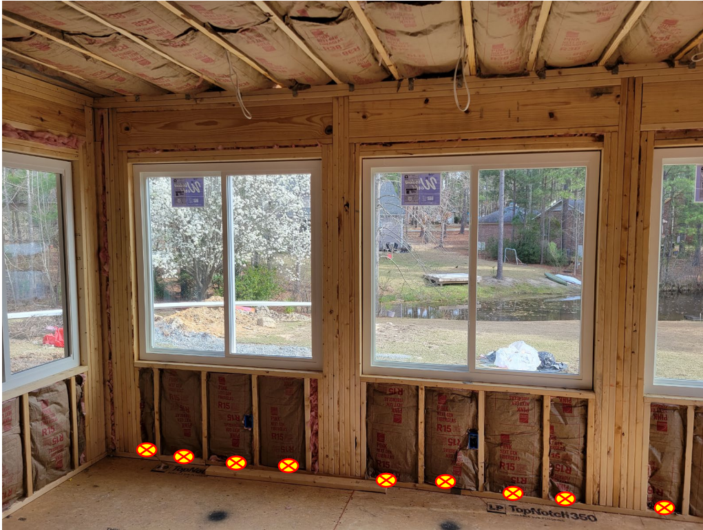
Item 1.b. Install additional 2 x 4 studs packed tightly to corners